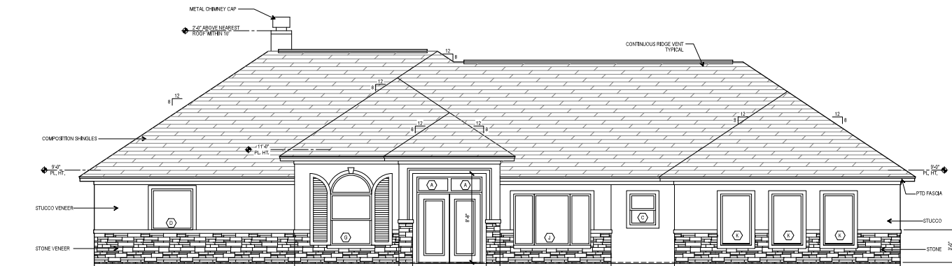
1 FRONT ELEVATION 1/4"=1'-0"