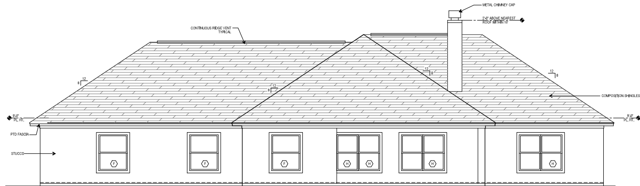
2 REAR ELEVATION 1/4"=1'-0"